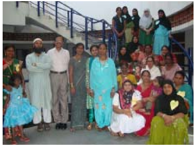
Participants and Resource persons at Peer educators training