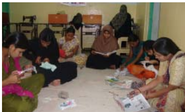
Young women at Tailoring and Embroidery training

School students' Parents meetings are conducted regularly to discuss about the children's education and also to discuss about the community issues.