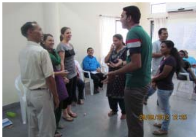
Participants at SAPW

Module 2: Workshop on Development and Peace Journalism was held to build/strengthen skills & perspectives which could enable people who are interested in working for peace, justice and reconciliation to articulate more effectively issues, concerns, perspectives as well as relationships between development, conflict & peace.