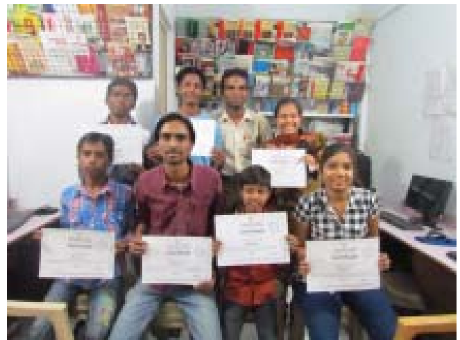
Youth programme at Peace Resource Centre

Youth also come to seek guidance related to work related problems, family problems, and career guidance. Most of the youth who come to the centre are Muslims and there are also a few Hindu, Christian and Dalit youth who come to the centre. This helps a small group of activists to learn good practices from other established NGOs and CBOs. It has led to discussions on faith, harmony, peace, respecting diversity, gender justice and creative non-violent action for bringing desired changes.