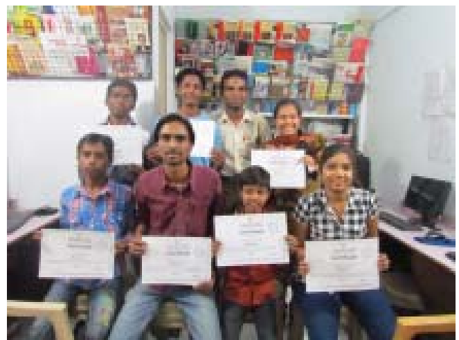
Youth programme at Peace Resource Centre

Youth also come to seek guidance related to work related problems, family problems, and career guidance. Most of the youth who come to the centre are Muslims and there are also a few Hindu, Christian and Dalit youth who come to the centre. This helps a small group of activists to learn good practices from other established NGOs and CBOs. It has led to discussions on faith, harmony, peace, respecting diversity, gender justice and creative non-violent action for bringing desired changes.