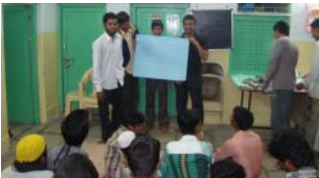
Young men during World AIDS Day programme

Regular monthly review meetings were organized for peer educators. This helped them in learning from each other's experiences and challenges.