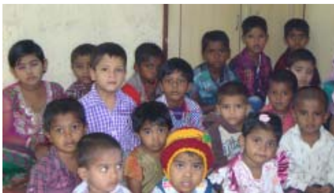
School children at sultan shahi centre

Interfaith Primary-level school offers education to 99 students from Hindu, Muslim and Dalit communities.